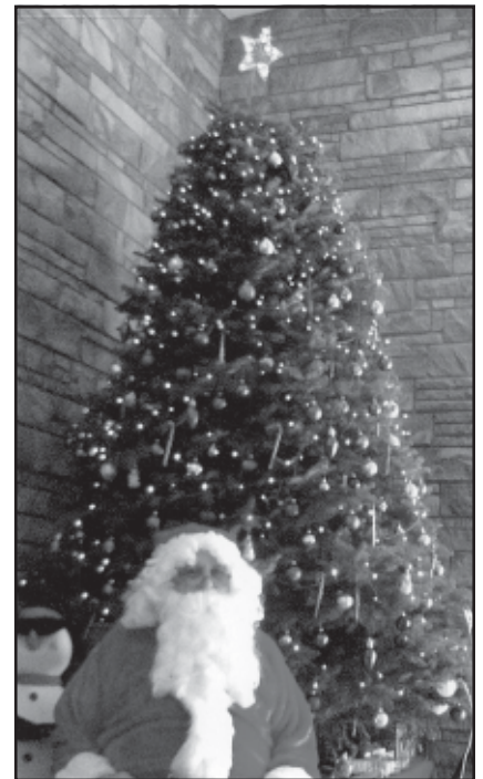
RIGHT: Santa presided at the tree.