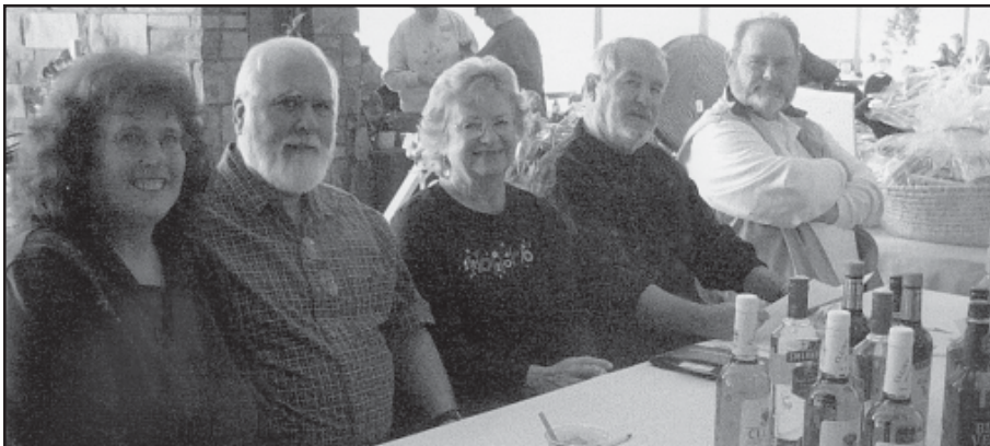
ABOVE: Volunteers presided at the gift table while...