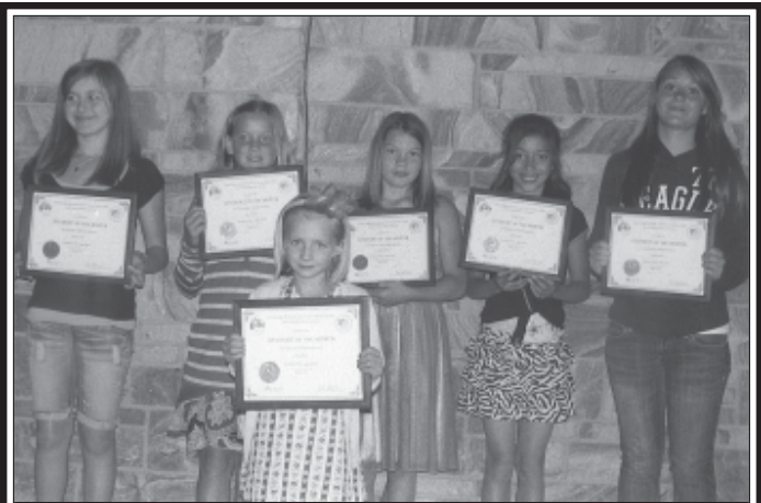
May Students of the Month

All alcoholic beverages must be purchased at the Lodge Bar. Bringing alcohol for consumption onto the Lodge premises from outside sources is a violation of ABC regulations and puts our liquor license in jeopardy.